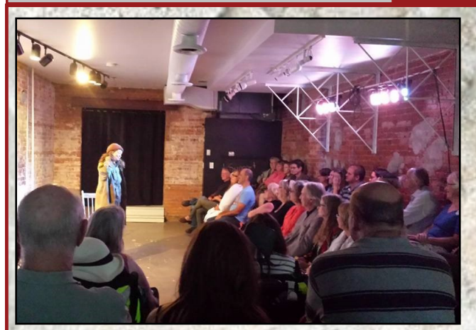
Ontario Street Theatre, Port Hope, August 2015