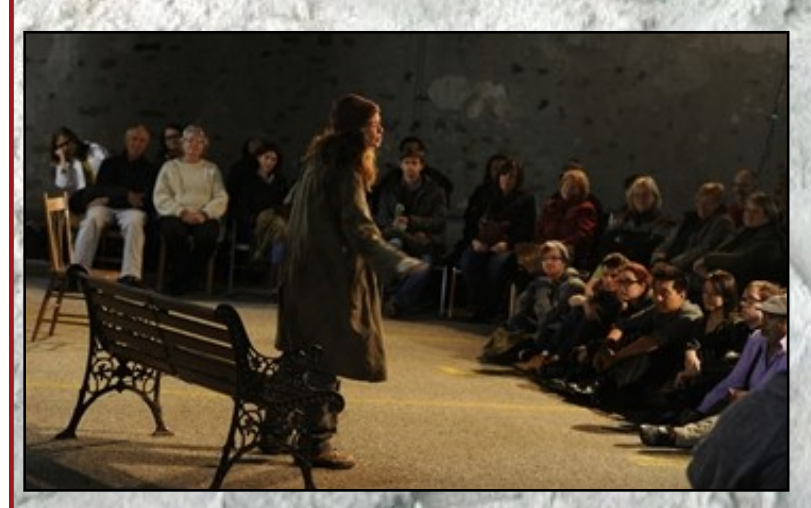
The Gaol Yard, Kitchener, September 2013 (Impact 2013)

The Food Bank of Waterloo Region, 2014